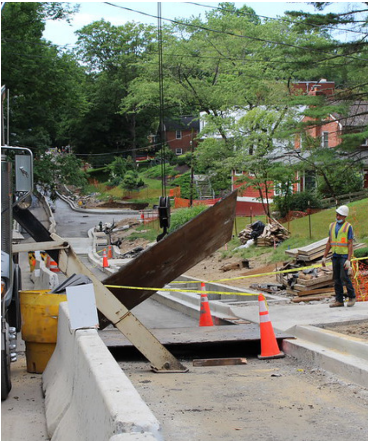
Access to driveway includes the use of steel plates

For more information, photos and Nori the Reporter's recap, please visit the project website at oregonavenueproject.com .