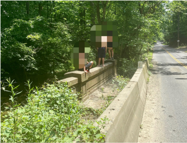
Pinehurst Creek Bridge

This publication is produced by the Oregon Avenue Reconstruction Project Community Engagement Team. We can be reached at 202.808.5400 or by email at info@oregonavenueproject.com .